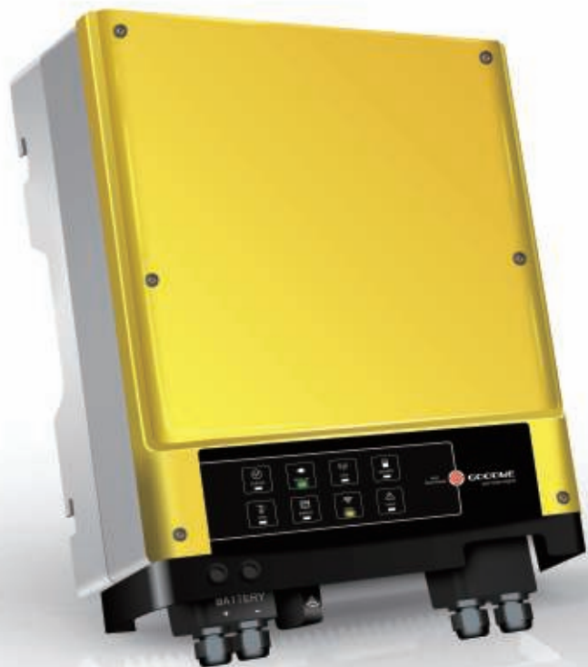
SBP Series Hybrid Inverter 3.6/5.0kW